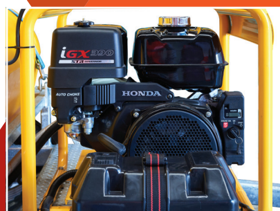
HONDA PETROL ENGINE