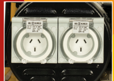
IP66 RATED PLUG SOCKETS