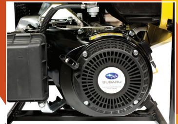
SUBARU EX ENGINE