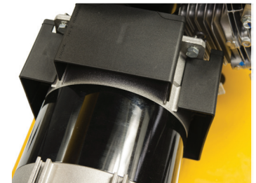
IP23 RATED ALTERNATOR