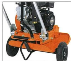
Transport Wheel (MVC-F60-F70-F80)