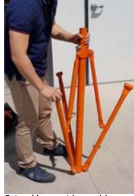
Extend legs out by pushing towards the ground