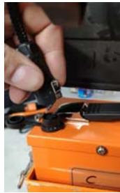
Connect power cable. Connector latches once pushed in place.