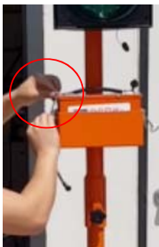
Lock latches to secure battery box