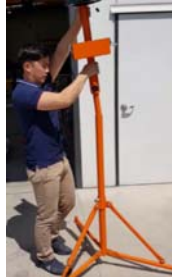
Slide lantern into the center locking column