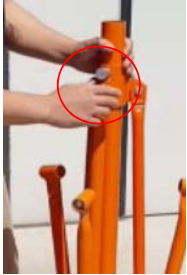
Pull spring pin to release leg