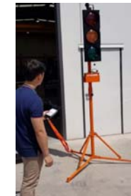
Unit is ready to operate with Hand Remote Control

IMPORTANT: ensure eSTOP™ is stable and is weighted down with sandbags prior to operation. One sand bag per tripod leg is required.