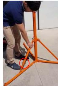
Place legs onto a flat surface and align adjustable locking column with pin holes to for uneven surface. (red circle)