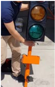
Use two hands to lift traffic lantern onto base