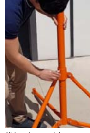
Slide pole up and down to adjust height then release pin to lock in place