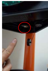
Switch on lantern