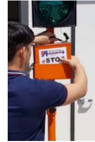
Insert battery pack into battery holder