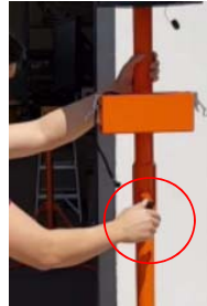
Secure with locking screw to stop lantern from rotating