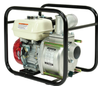
SEMI TRASH PUMPS