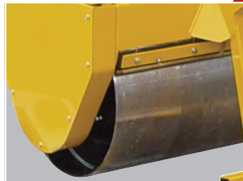
CHAMFERED ROLLER EDGE