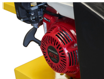
POWERED BY HONDA GX270