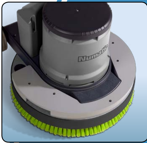
Optional 10kg additional weight