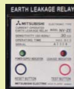
Earth Leakage Relay