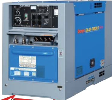
Narrow Body Width 560mm!

Two people can perform welding simultaneously.