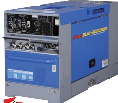
Narrow Body Width 560mm!