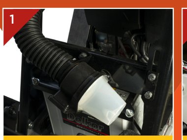
CYCLONE AIR CLEANERS

Serviceability with easy access to all maintenance points.