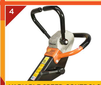
VARIABLE SPEED CONTROLS