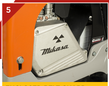
ENCLOSED BELT GUARD