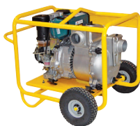
FULL TRASH PUMPS