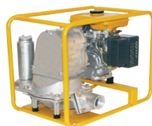
SUBMERSIBLES - PETROL OR DIESEL