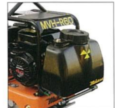
MVH-R60 Water tank (8.5ℓ)