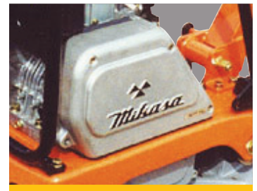
ENCLOSED BELT GUARD