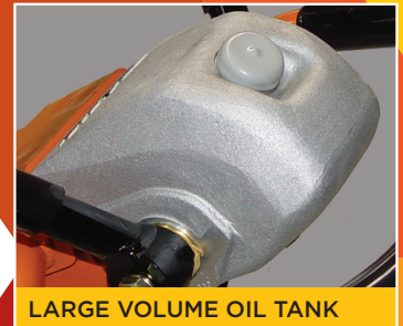
LARGE VOLUME OIL TANK