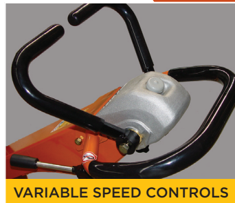
VARIABLE SPEED CONTROLS

Subaru petrol engine Variable speed controls Large volume hydraulic tank Fold-up handle Sturdy lifting frame Enclosed belt guard