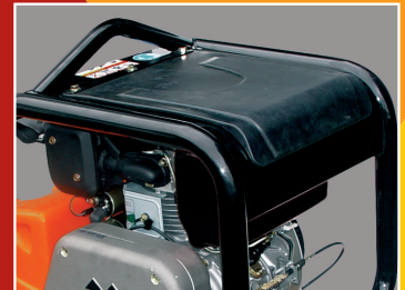
STURDY LIFTING FRAME